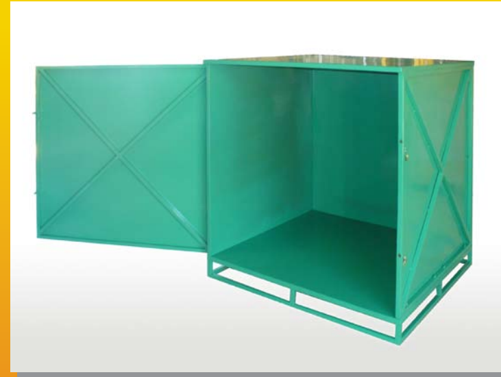
Ease of operation, no complications.

To purchase your new segregation device, please contact: